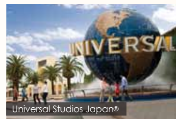
Universal Studios Japan®