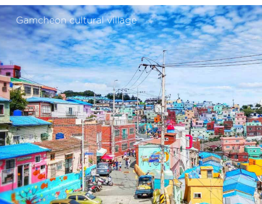
Gamcheon cultural village